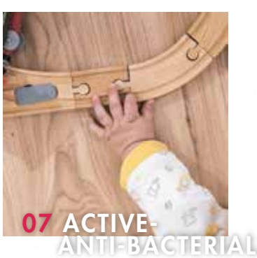
Available in PU, acrylic and water based range with sanitising action