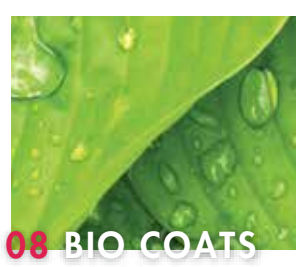
Reduction of pollution and the reception of new trends in eco - design with wide range of clear and pigmented bio - cycle