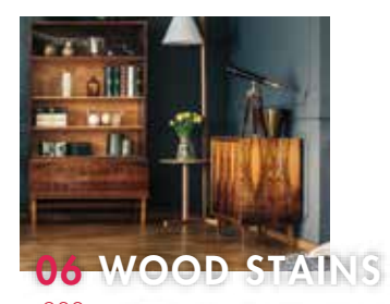
200+ stain options