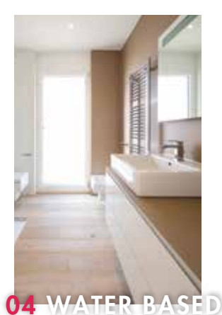
Crafted with care to be eco - friendly, odourless, provide low emission & extremely good coverage 2% to 95% gloss