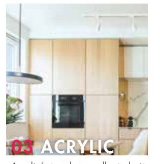
Acrylic's touch, excellent clarity, non-yellowing, natural grain finish with robust hardness & UV resistance,in various gloss levels