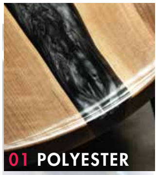
Luxurious and clear mirror like finish. Clear as well as pigmented 1000+ shades